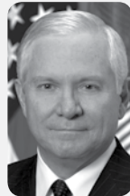
Robert M. Gates